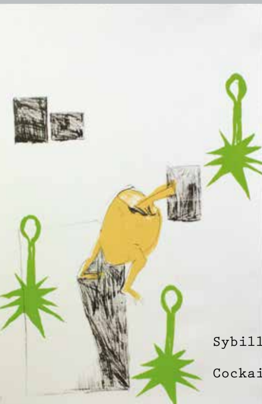
Sybille Rath Cockaigne_2017