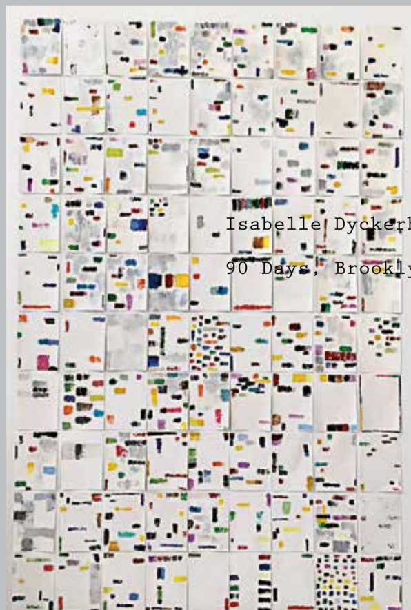
Isabelle Dyckerhoff 90 Days, Brooklyn Diary_2015