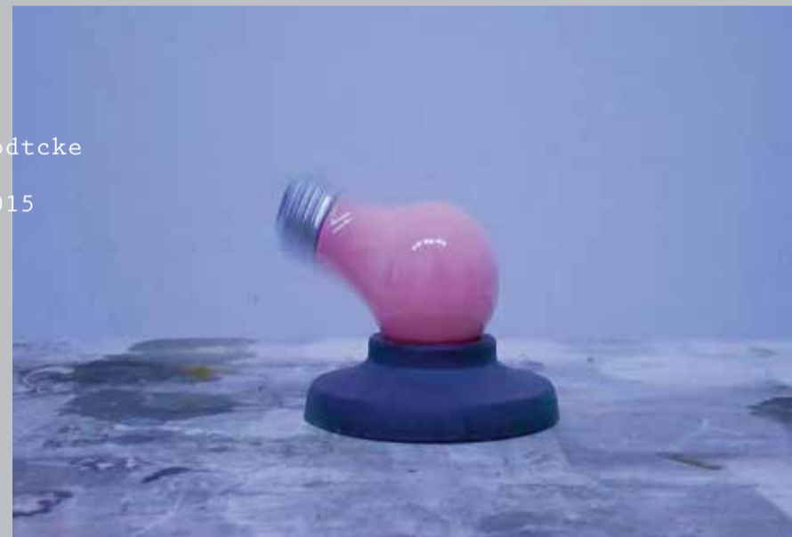
Anne Wodtcke bulb_2015