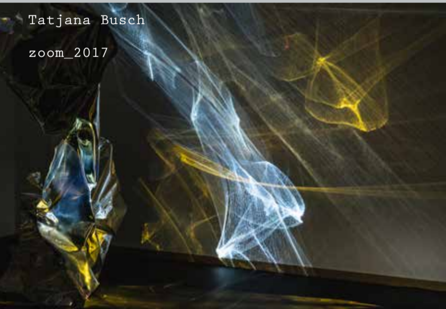
Tatjana Busch zoom_2017

For the exhibition, all artists have selected works that could not have been created without the influences of their fellowships in New York. The exhibition X=change not only invites visitors to discover the developments of individual artists, but also to discuss the significance of cultural exchange on the basis of these examples.